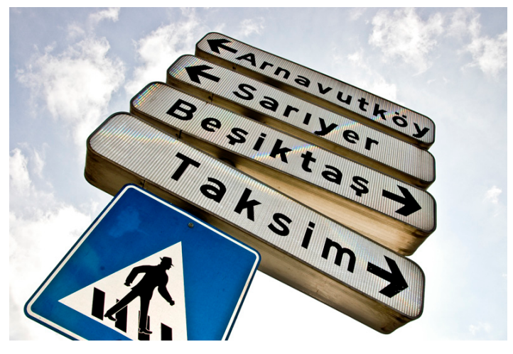
Pınar Gediközer, Mobility, 2008

Each unit includes classroom activities, multimedia resources, terminology and opportunities for discussion; we encourage you to adapt, shape and build upon these materials to best meet the needs of your students and teaching curriculum.