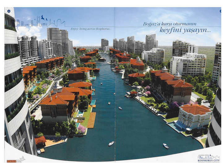
Promotional material for "Bosphorus City," a development project by SiNPAŞ