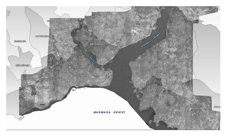
Aerial Image, İstanbul Şehir Rehberi [İstanbul City Guide], 1966