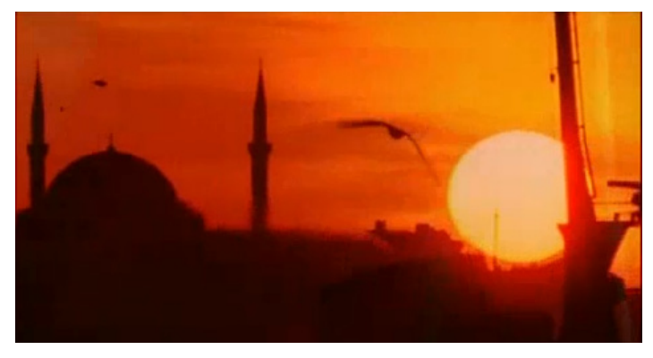
İstanbul Welcomes You , İstanbul Metropolitan Municipality promotional video, 2011.

These are not the taglines we see in touristic brochures; they are not generalizations. Examining İstanbul from a broad range of perspectives, the Becoming Istanbul project seeks not to present a single portrait of İstanbul, but rather to stimulate discussion around the concept of cities; to criticize stereotypes surrounding cities and their inhabitants; and to act as a catalyst in reconsidering urban development, culture and processes of change.