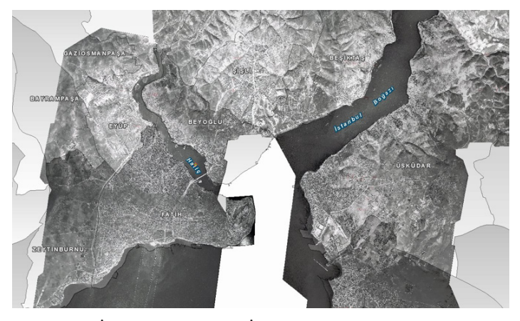
Aerial Image, İstanbul Şehir Rehberi [İstanbul City Guide], 1982