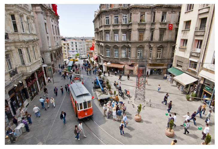
Pınar Gediközer, Mobility, 2008

Urban Planning — integrates land use planning and transportation planning to improve the built, economic and social environments of communities