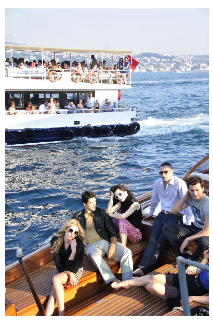
Cast of Küçük Sırlar [Little Secrets], Vogue Türkiye, August 2010