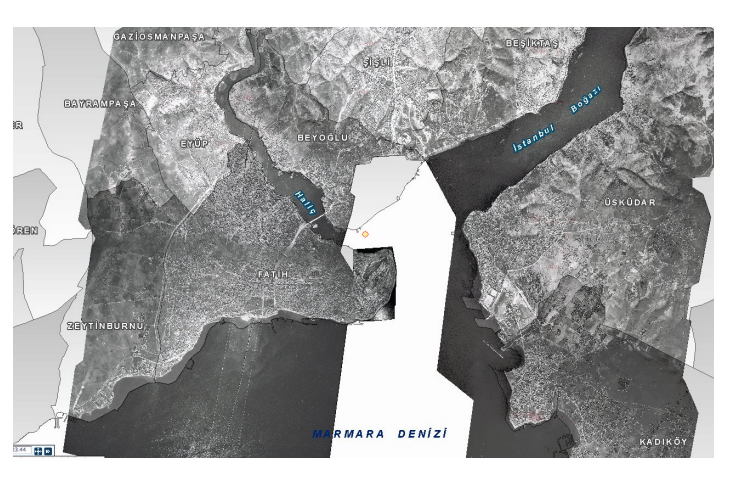
Aerial Image, İstanbul Şehir Rehberi [İstanbul City Guide], 1946