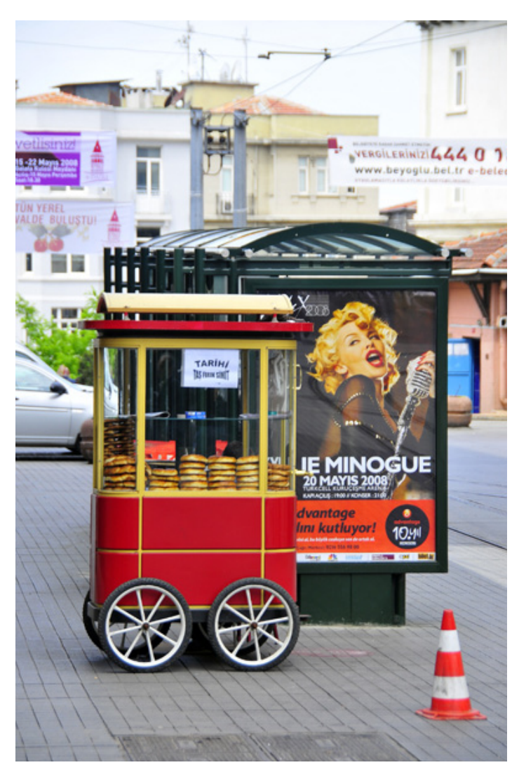
Laleper Aytek, Fastfood, 2008