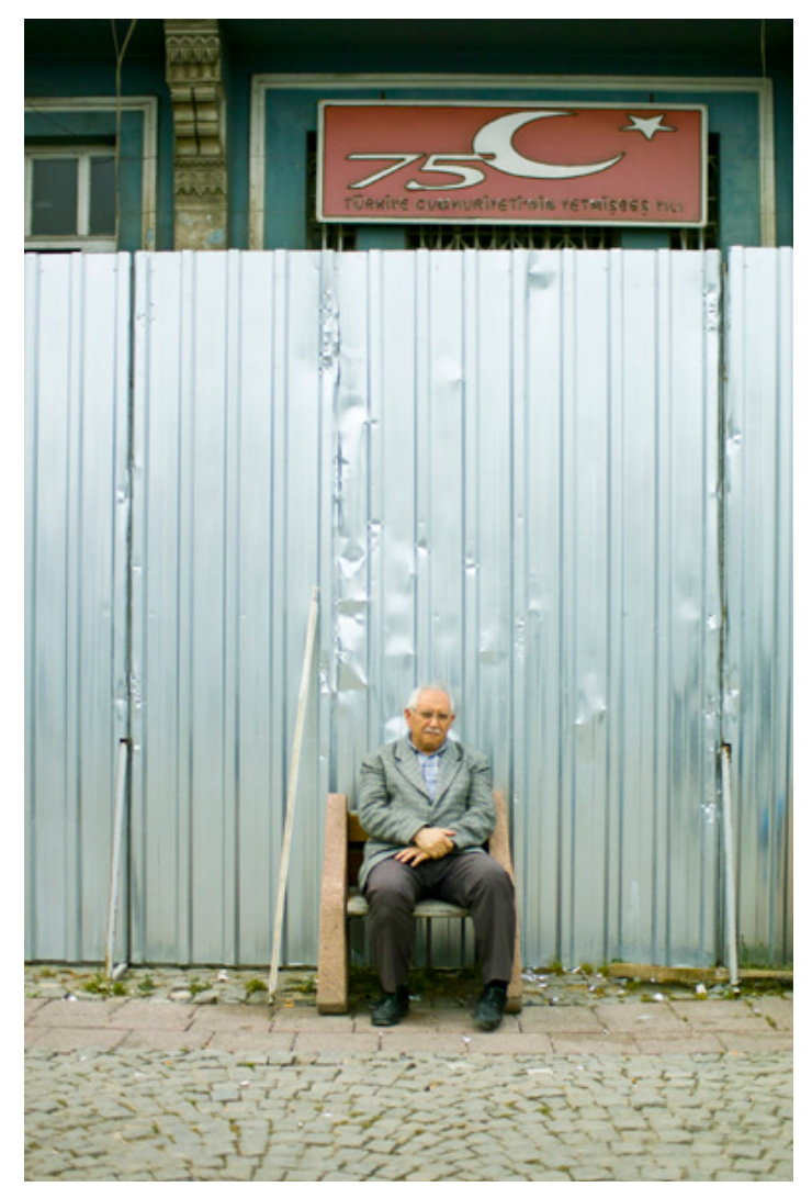
Pınar Gediközer, Belonging, 2008